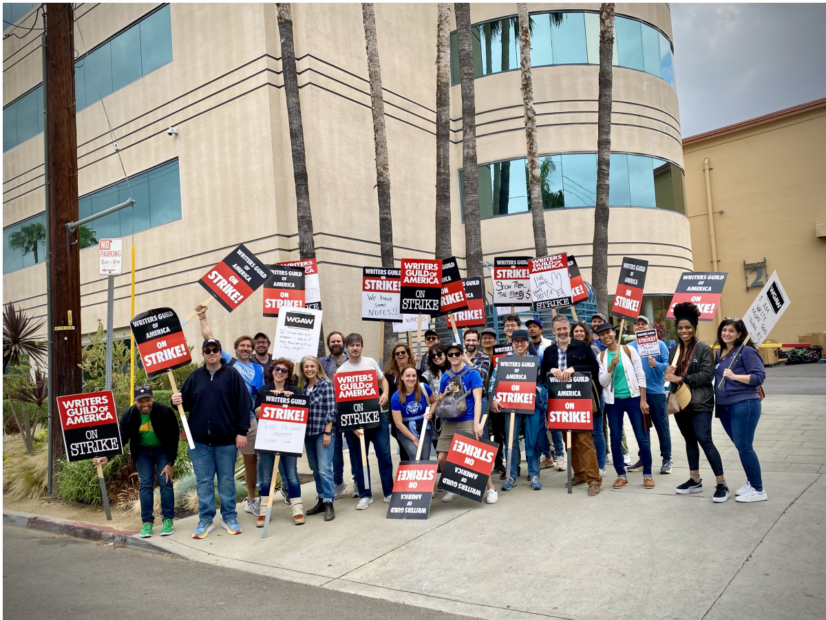
An amazing group of SOA alumni joined the picket line in support of the WGA strike.